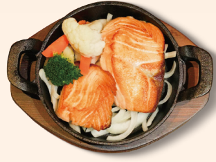
SALMON 三文鱼 Grilled salmon with sea salt and vegetables