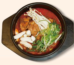
PORK BONE SOUP 猪骨汤 Spicy pork back bone stew