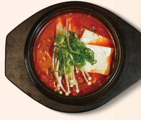
KIMCHI JJIGAE 泡菜汤 Spicy Kimchi stew with pork and tofu