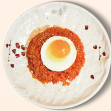
KIMCHI FRIED RICE 泡菜炒饭 Stir fried Kimchi, rice and spring onions