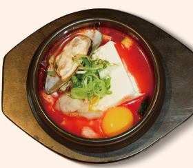
SPICY SEAFOOD TOFU SOUP 海鲜豆腐汤 Spicy seafood soft tofu stew with egg yolk