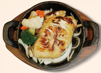
BLACK COD 黑鳕鱼 Grilled black cod marinated with sweet miso and vegetables