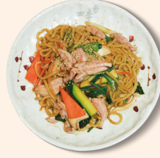
CHICKEN FRIED NOODLE 鸡肉炒面 Stir fried thick noodles with vegetables and chicken in a soy sauce