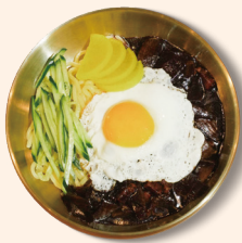
JAJANGMYEON 炸酱面 Korean-style Chinese noodle dish topped with a thick sauce made of chunjang, diced pork, egg and vegetables