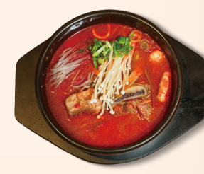
SPICY GALBITANG 辣牛排骨汤 Spicy short beef rib soup along in a beef stock