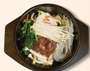
HOT POT BULGOGI 牛肉蘑菇汤 Traditional style beef Bulgogi broth with mixed mushrooms, glass noodle and shredded spring onions