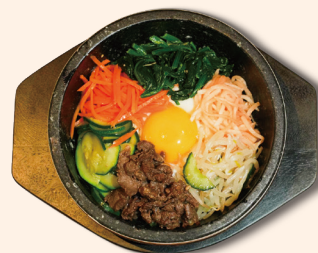
BEEF BIBIMBAP 牛肉石锅拌饭 13.8