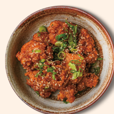
Korean fried chicken with garlic and soy sauce