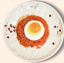
KIMCHI FRIED RICE 泡菜炒饭 Stir fried Kimchi, rice and spring onions