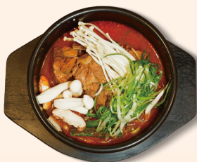
PORK BONE SOUP 猪骨汤 Spicy pork back bone stew