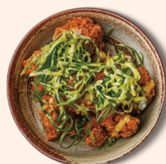
Spring onion on the top with honey mustard sauce