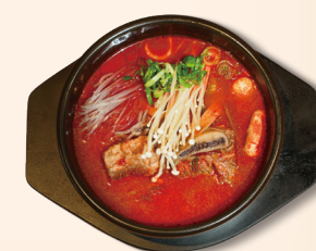
SPICY GALBITANG 辣牛排骨汤 Spicy short beef rib soup along in a beef stock