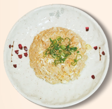
EGG FRIED RICE 蛋炒饭 Stir fried rice with eggs and spring onions