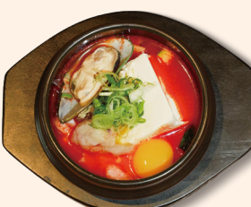
SPICY SEAFOOD TOFU SOUP 海鲜豆腐汤 Spicy seafood soft tofu stew with egg yolk