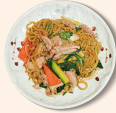
CHICKEN FRIED NOODLE 鸡肉炒面 Stir fried thick noodles with vegetables and chicken in a soy sauce