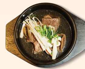
GALBITANG 牛排骨汤 Mild short beef rib soup along in a beef stock