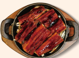
EEL 鳗鱼 Grilled eel with sweet eel sauce and vegetables