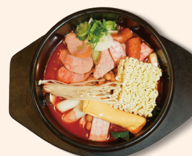
BUDAE JJIGAE 部队锅 Spicy Kimchi stew with western spam, Frankfurt sausage, baked beans, tofu and ramen noodle