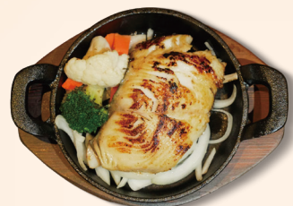
BLACK COD 黑鳕鱼 Grilled black cod marinated with sweet miso and vegetables