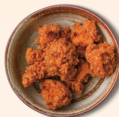
Korean style original fried without sauce