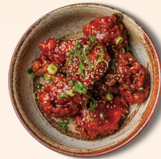
Korean fried chicken marinated with sweet and spicy sauce