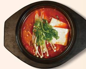
KIMCHI JJIGAE 泡菜汤 Spicy Kimchi stew with pork and tofu