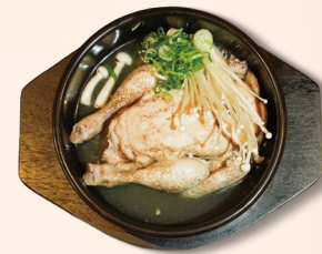
BAEKSUK 参鸡汤 Traditional chicken soup