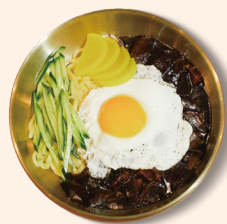
JAJANGMYEON 炸酱面 Korean-style Chinese noodle dish topped with a thick sauce made of chunjang, diced pork, egg and vegetables