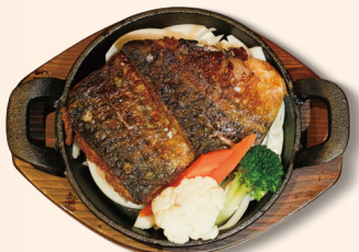
MACKEREL 鲭鱼 Grilled mackerel with sea salt and vegetables