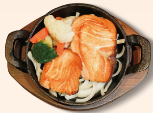
SALMON 三文鱼 Grilled salmon with sea salt and vegetables